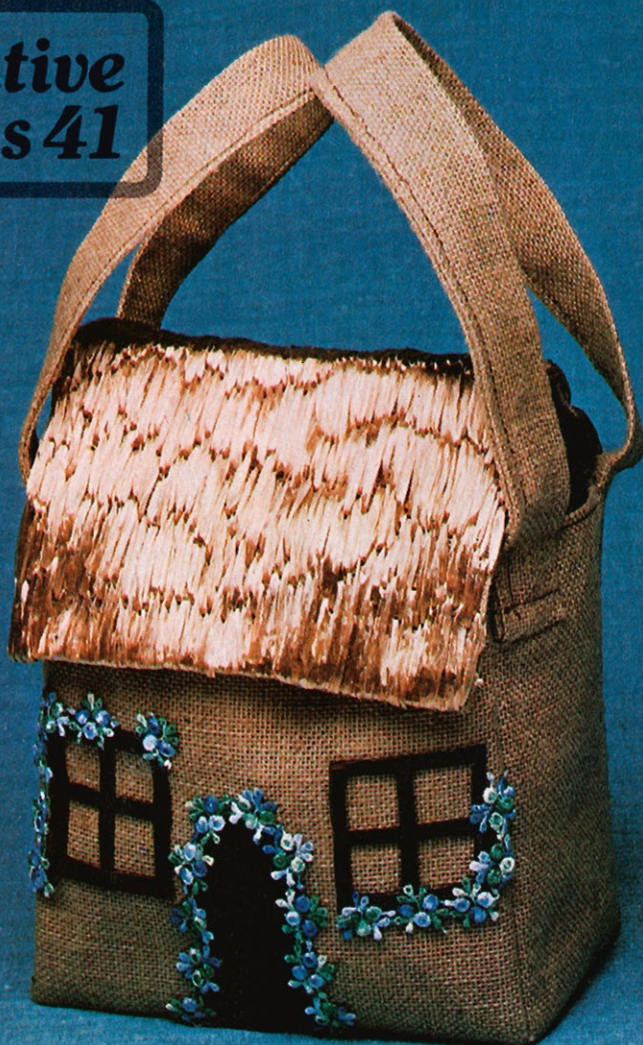
This bag's youthful appeal makes it a welcome gift for a young girl.